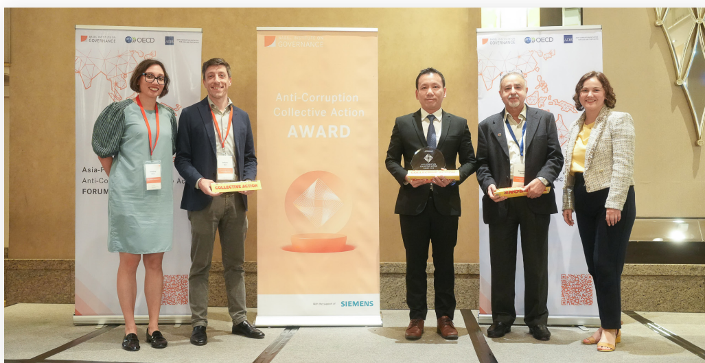
Image: Finalists of the Basel Institute's Anti-Corruption Collective Action Award, presented at the Asia-Pacific Anti-Corruption Collective Action Forum in Manila, Philippines, 25 September 2023, which was won by the Thai CAC following a jury selection and public vote.

According to the Thai CAC, the supply-side of corruption – and in particular, bribery – on which the initiative focusses – is just one part of the anti-corruption puzzle. Other key areas are public sector and political corruption, as well as corruption in large-scale procurement projects. For this reason, the Thai CAC is supportive of other initiatives in the country, including the work of Anti-Corruption Thailand, which is reviewed below. Further, in 2023, the Thai Institute of Directors signed a Memorandum of Understanding with the Thai National Anti-Corruption Commission, the Securities and Exchange Commission and 51 state-owned enterprises to fight against corruption.