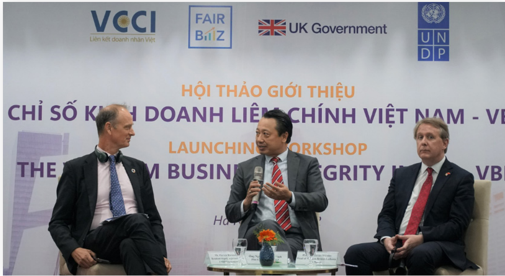
Image: Launch of the Vietnam Business Integrity Index, Hanoi, 21 September 2022.