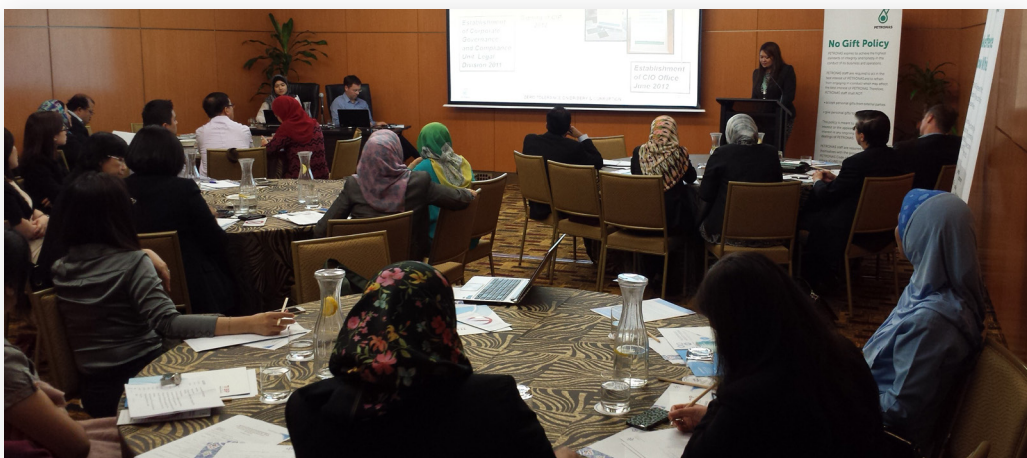
Image: Participants at a Corporate Integrity System Best Practice Seminar.

With the lack of any self- or objective assessment, and a largely voluntary monitoring mechanism, the implementation of the pledge depends on the genuine commitment, good faith and capacity of the signatory company. However, in the recent past, MACC has taken steps towards a more proactive engagement with the private sector, raising awareness and providing training on business integrity. This is demonstrated by the inclusion of site visits to selected companies to help signatories of the pledge identify good practices. This change in approach recognises that implementing a value- and risk-based approach to anti-corruption is needed to ensure effective corporate compliance systems. It also opens more opportunities to strengthen peer learning and the sharing of good practices among signatories of the Corporate Integrity Pledge.