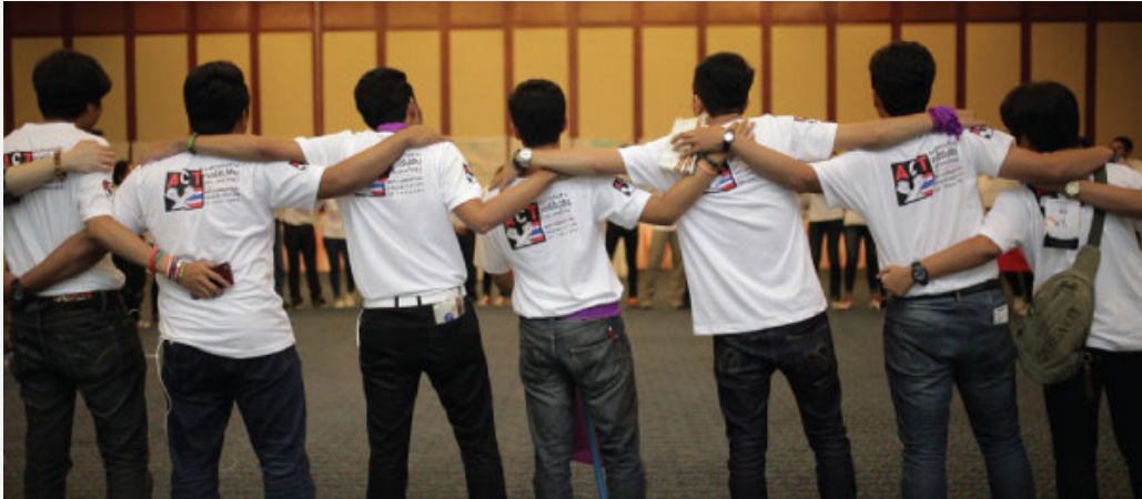
Image: Student participants at an Act-organised training camp to create awareness and understanding of the different forms of corruption.

– not just commitments to act with integrity. Finally, they underlined both the importance and difficulty of collecting data to measure the improvements coming from legal changes: a lot of data is observational and some must also be kept confidential to maintain the security of the actors involved. It is nevertheless critical to collect relevant data to build the overall evidence-base of anti-corruption efforts.